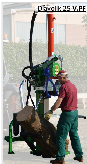
Diavolik 25 V.PF